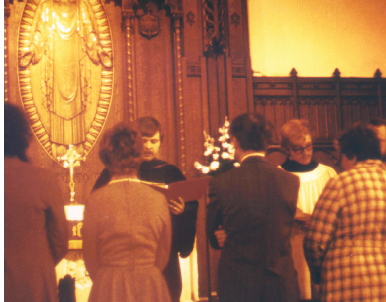
Commissioning of the First Class of Stephen Ministers