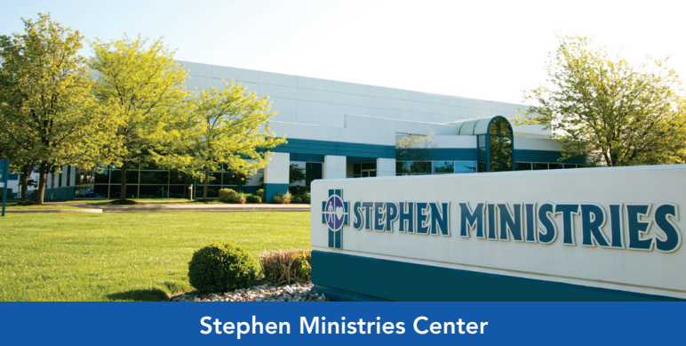
Stephen Ministries Center